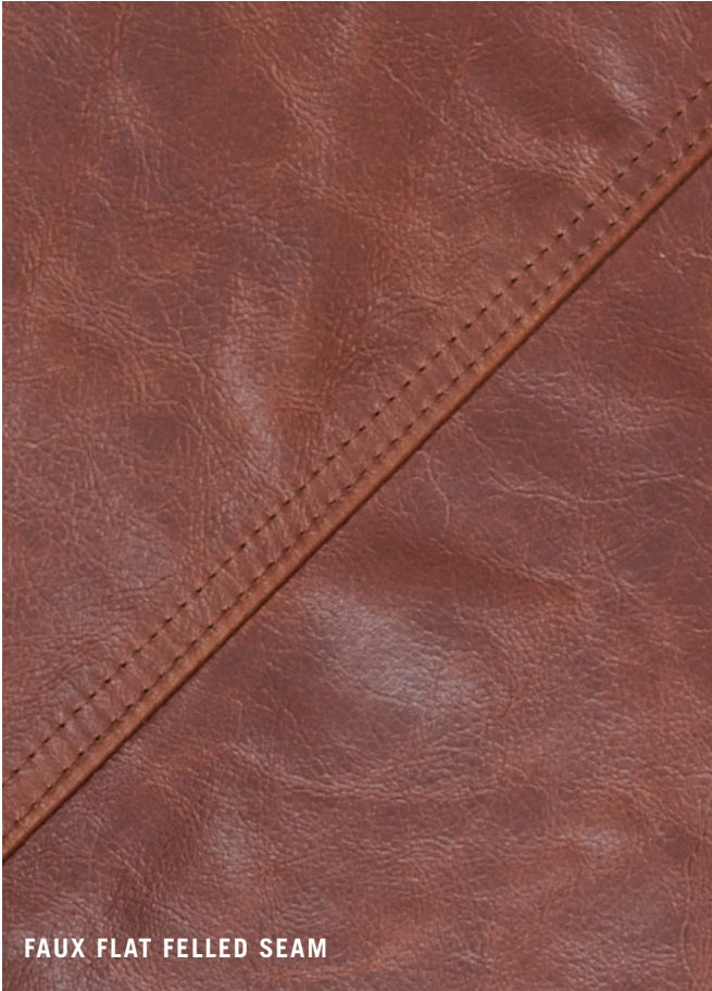
FAUX FLAT FELLED SEAM