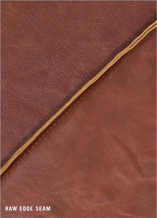
RAW EDGE SEAM