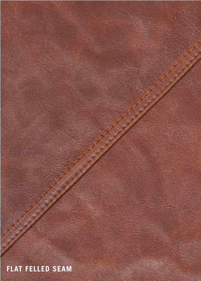
FLAT FELLED SEAM