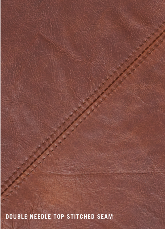
DOUBLE NEEDLE TOP STITCHED SEAM