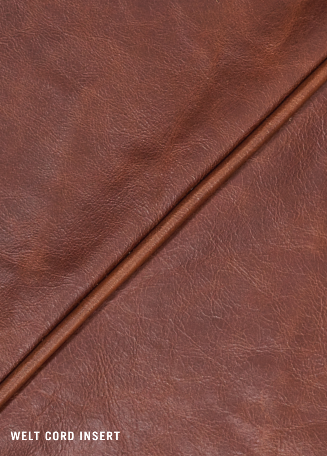
WELT CORD INSERT