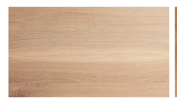
CASK American White Oak

Our products are crafted from American White Oak, American Black Walnut, and American Hard Maple. These quintessential hardwoods are considered among the most durable. They are finished with a durable, UV-resistant, matte top coat. Our region is net positive in tree harvesting and we take care in our sourcing to see that nothing goes to waste. As part of our commitment to sustainability, we initiated our "Tree for Every Top" program in 2021. For every tabletop we sell, we plant a sapling in our community as an investment in the environment.