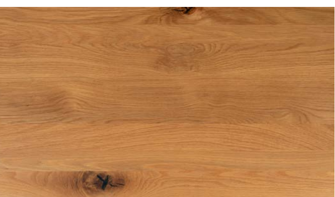
NATURAL American White Oak