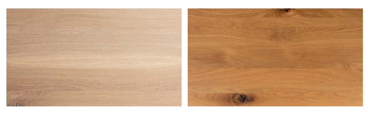
CASK American White Oak

Our products are crafted from American White Oak, American Black Walnut, and American Hard Maple. These quintessential hardwoods are considered among the most durable. They are finished with a durable, UV-resistant, matte top coat. Our region is net positive in tree harvesting and we take care in our sourcing to see that nothing goes to waste. As part of our commitment to sustainability, we initiated our "Tree for Every Top" program in 2021. For every tabletop we sell, we plant a sapling in our community as an investment in the environment.